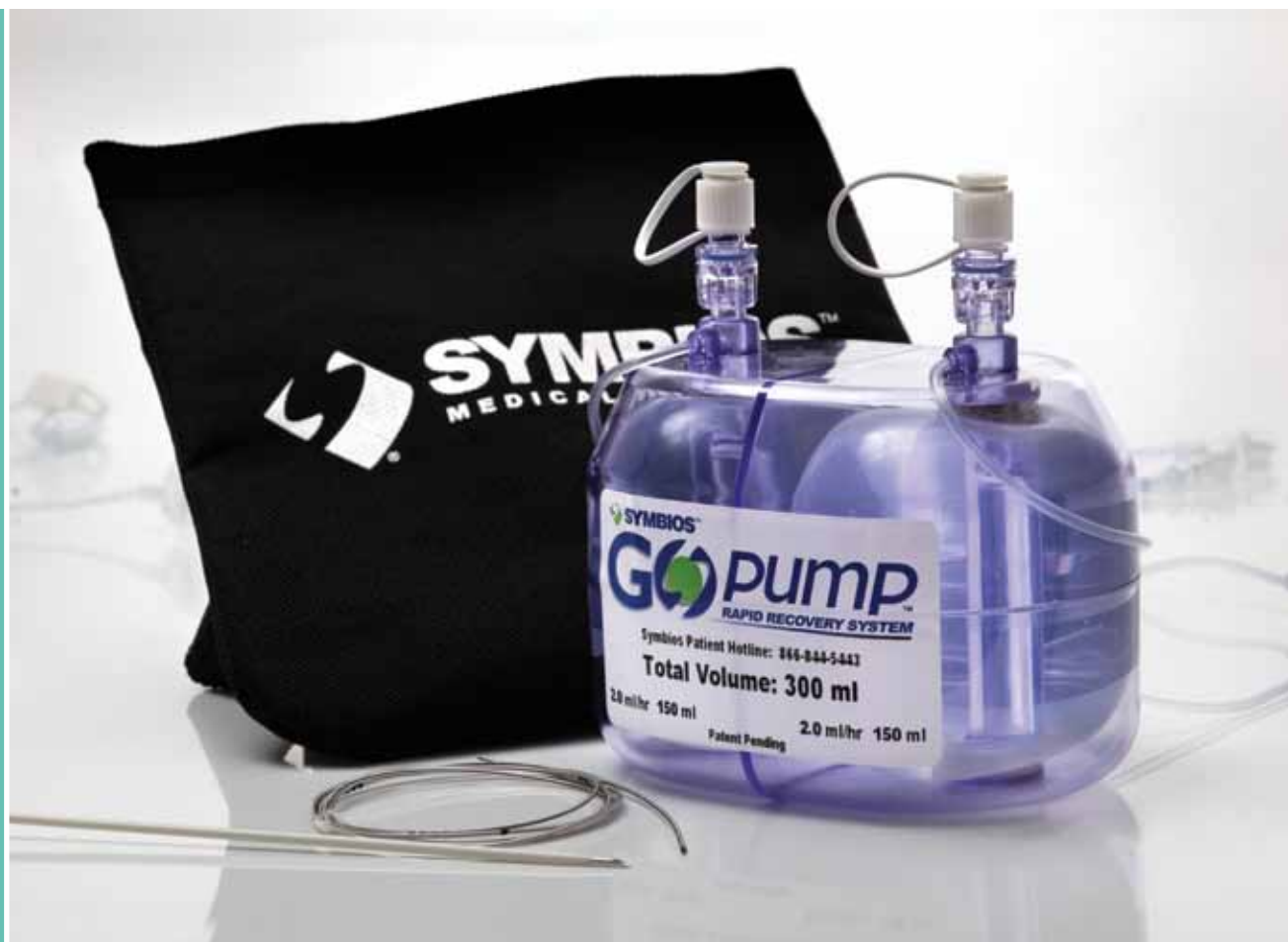
Ambulatory pain pump and catheter set for surgical site infusion